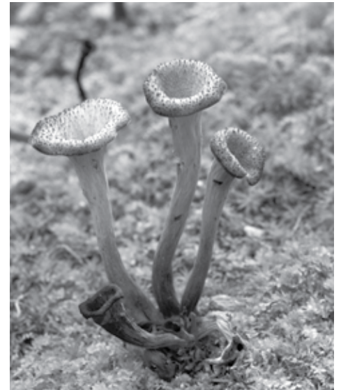
What foray is famous for Craterellus cornucopioides , black trumpets?