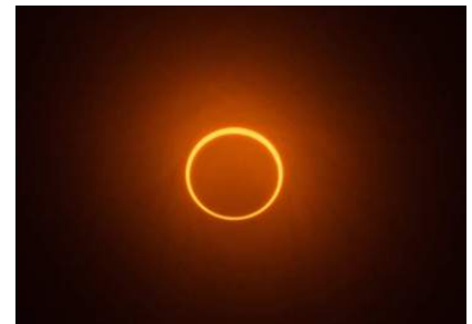
Solar Eclipse, October 14

Dick Silbar and Jere Turner (505) 570-9185 and (505) 603-1639 640 Alta Vista, Apts. 311 and 303, Santa Fe, NM 87505