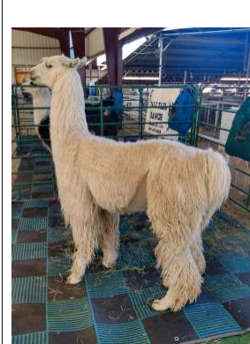
Llama, Fiber Arts